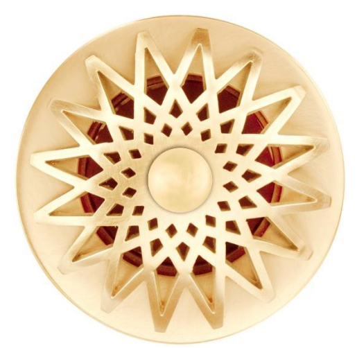
Shown in "SSB-SCR01"