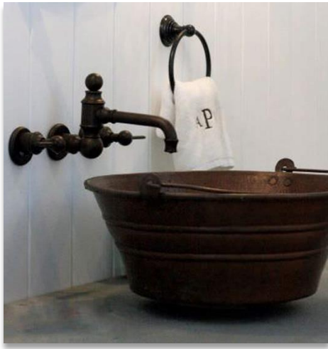
Shown in DB